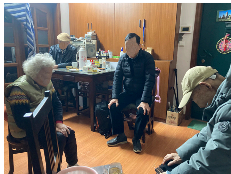
In November, our staff and Chinese believers had prayer time at this small House church. These believers have gathered here for the past 20 years.

Chinese believers know the Age of Man is coming to an end. They know their great calling as always, is to share and live out God's Truth to not only the next generation but with as many Chinese as they can. They've shared how there is increasing spiritual darkness working "out in the field." One of Satan's tactics is if he can't speed you up, he will slow you down. People are drained. Tired. Chinese pastors and missionaries have shared with us that in this crazy day and age, people want a Savior but not another Lord (master). They just want the product but not the process. Regardless, they work tirelessly to share the gospel. We receive many prayer requests like the one below.