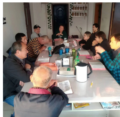
Local pastors and lay leaders continually hold Bible studies and training sessions.