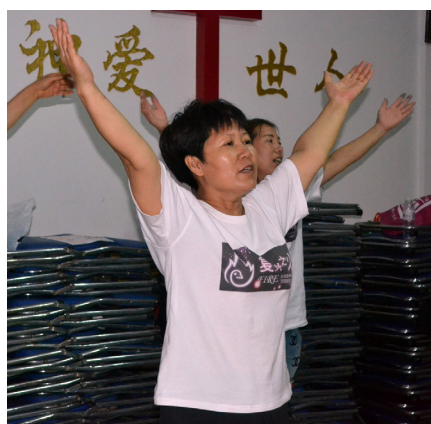
Teaching believers how to pray for China, Israel and the nations.