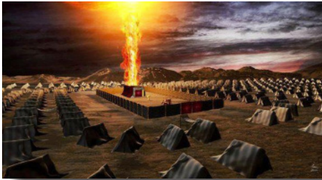
The Tabernacle in the Wilderness and the Pillar of Fire.

F rom Genesis to Revelation, God has always desired to dwell or tabernacle with His children.