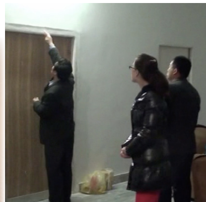
We assist churches and meeting points with purchases and renovations. A brother anoints the entrances of their new tabernacle! ~ Shandong

We show our students how the Hanukkah menorah has a center candle called the "servant" (Heb. shamash ) which is used to light all the other candles. They immediately thought of Yeshua HaMashiach or Jesus the Messiah.