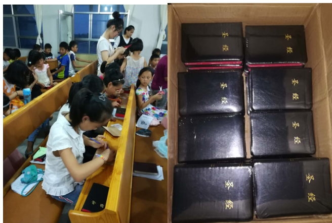
Providing Bibles to a Teenage Bible Camp ~ Shandong