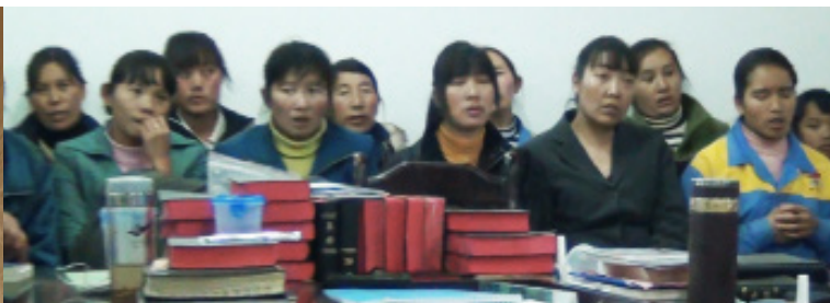
Meeting the continual need for God's Word and training.