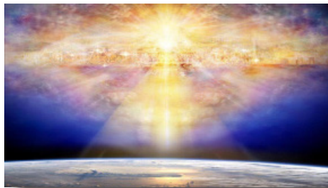
God's Holy City coming down to earth.

It started in the Garden of Eden, when God asked, “Where are you?” Genesis 3:9