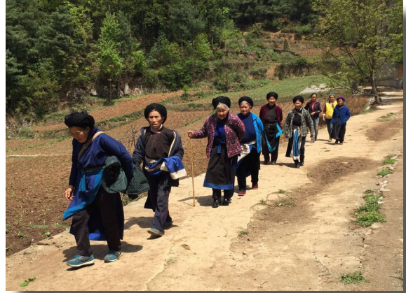
These Yi tribe members are in their 70s. They don't find it a chore to walk miles to church. They told us they consider it a blessing.

R ecently, we were in Yunnan Province, located in the south-central part of China. It's where most of China's minority tribes live. Over the decades, God has used us to plant many fertile "seeds" in this area. What's wonderful is that every time we return, we find greater spiritual growth. It's totally contrary to what the Apostle Paul experienced with the Galatians. He quickly returned after one missionary trip and discovered the locals had totally abandoned God's life-giving message for another futile belief system (Gal.1:7). Not so in Yunnan.