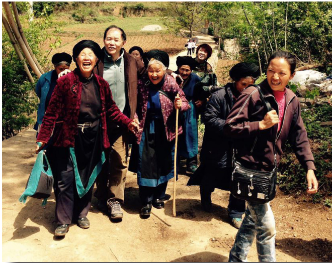
As we walk alongside them, there is no greater joy than bringing them your warmest greetings and gifts as they shower us with theirs -- God's love and hospitality.