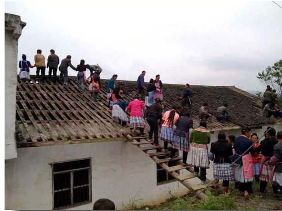
Through your generosity, East Gates has been able to help the Yunnan tribes build the churches they've desperately needed. As always, it's a congregational affair, where each person takes part.