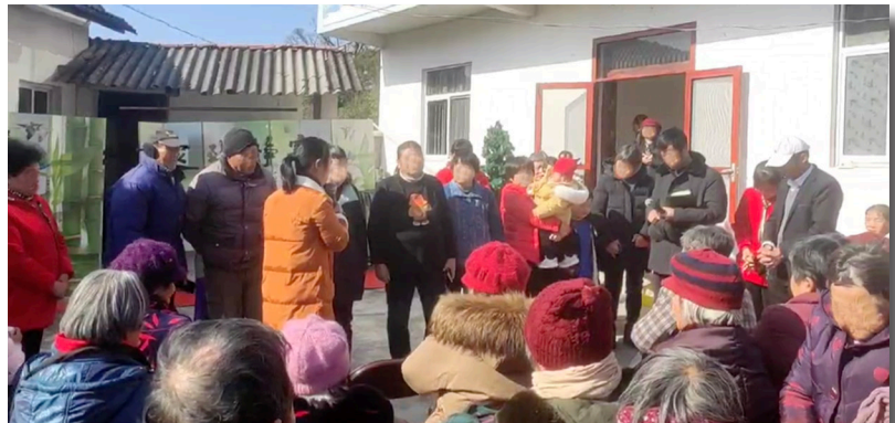
A sister in Anhui province (orange coat) shares God’s faith, hope and love with her neighbors.

“...and the blood of Jesus His Son cleanses us from all sin. If we say that we have no sin, we are deceiving ourselves and the truth is not in us. If we confess our sins, He is faithful and righteous, so that He will forgive us our sins and cleanse us from all unrighteousness.”