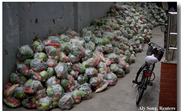
Bagged vegetables wait to be loaded onto trucks or any type of motor vehicle for delivery throughout Shanghai.