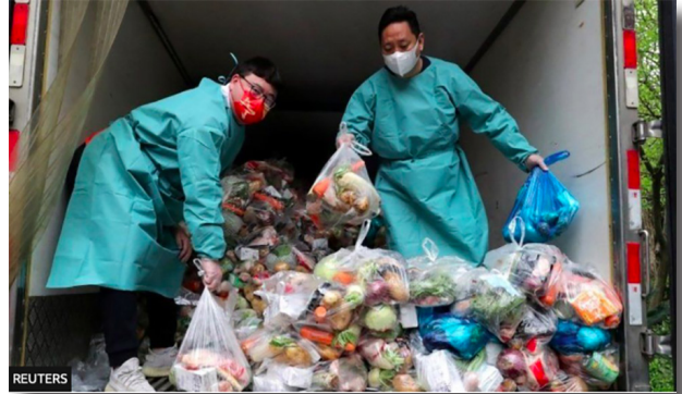
During the Shanghai lockdown, volunteers have tried to meet the daily internet food orders as efficiently and quickly as possible.

Also, this lockdown has made everyone focus on cleanliness. Before, every home didn't have all these different kinds of disinfectants, alcohol, cotton and disposable gloves. Now, everything that enters the house has to be sprayed, wiped, washed... tirelessly. Our regular rhythm to life has turned upside down and hoarding has become a necessity. In fact, just writing about this has not been easy. There has been much sadness and confusion every day. Flowers bought a month ago are now dried to make a flower basket as a souvenir.