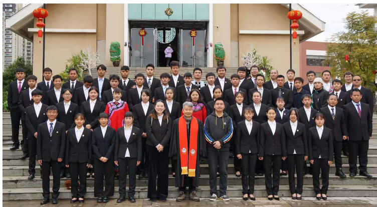
Yunnan Theological Seminary staff and students.