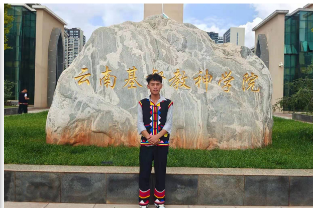
East Gates took care of this young man's seminary tuition. We make sure the potential student has a good pastoral reference and a heart to serve the church upon graduation.

A Chinese preacher, whom we work closely with, recently sent us a sermon that a fellow pastor/brother gave to his congregants on how they should grow from the COVID pandemic experience. He began with seven insights gained from the two month lockdown in Shanghai.