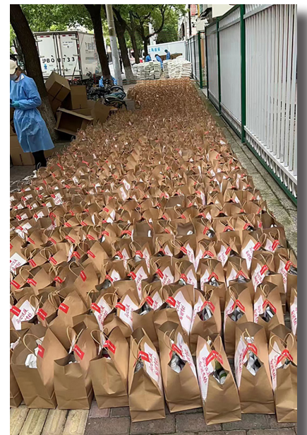
Bags of disinfectant prepared for major distribution to all businesses and homes.