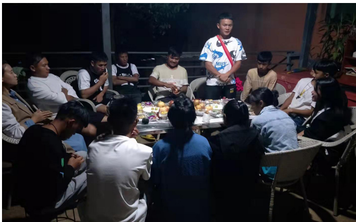
Lahu Tribe Training Center students gather for prayer and fellowship.

When it comes to guarding our hearts against every evil thing, we’re teaching our students that we’ve entered a very special season of the year. On the biblical calendar, we’re in the 9th month of Kislev. It’s known as a month of darkness aflame with hope because it contains the longest night of the year yet is host to Hanukkah (Heb. dedication ) also known as the Festival of Dedication or Festival of Lights. It was an annual festival that Jesus was well-acquainted with for we read in John 10:22-23, “ At that time the Feast of Dedication took place in Jerusalem; it was winter, and Jesus was walking in the temple area, in the portico of Solomon. ” We ask our students why was this significant? Because here was Jesus, the Light of the World , piercing the darkness as the surrounding Jews wanted to stone Him because they couldn’t believe He was the Son of God. Here was Jesus, Temple of the Living God , observing a festival that commemorated a time about 200 years before He was born; when the Second Temple in Jerusalem was grossly desecrated by the colossal Syrian-Greek Empire, yet eventually cleansed and rededicated back to God through the military victory of a handful of Maccabean Jewish priests/warriors who all had the heart of a lion. A miracle occurred because the Maccabees guarded, treasured and restored what was holy and would not assimilate into Hellenistic culture.