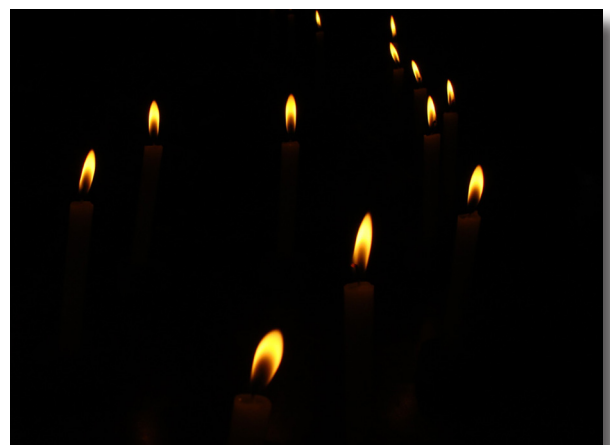
Jesus lives in each one of them to light up China.