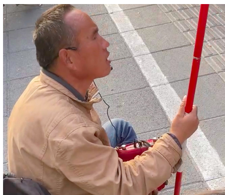
Blind Christian beggar singing the hymn, "Tears of Thanksgiving."