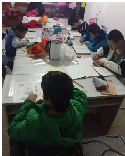
House of Olive handicapped youth redeeming the time in a safe and secure environment.