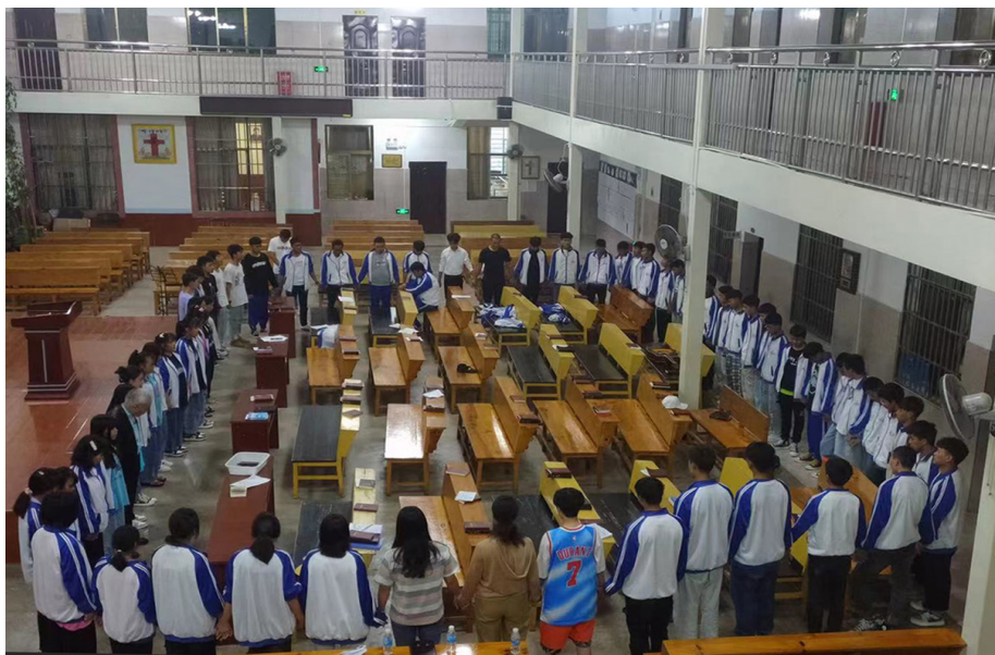
East Gates has sown much into the Baoshan Bible Training Center in Yunnan Province. Here, teachers and students put on the armor of God daily and live out Colossians 2:5 . They are a prayer force to contend with!

During this past year, we’ve been teaching our Chinese students that throughout the ages, Judeo-Christians have always been in a spiritual battle of immense proportions. Before the foundations of the world when God chose us to be His holy sons and daughters (Eph.1:3-4, Rom.8:29-30), we soon discovered we were born into a military family with a doubled-edged sword in one hand (Word of God) and a shield of faith in the other! Essentially, Jesus is our armor -- our helmet of salvation (Yeshua), breastplate of righteousness, belt of Truth, feet shod with the gospel of peace (shalom) and our prayer language so we can boldly proclaim the gospel (Eph.6:10-19)!