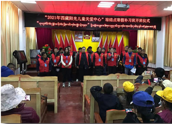
The opening ceremonies of the winter tutorial class. The banner above says: "Tibet Sunshine Children Care Center 2021 - An Opening Ceremony of the Winter Tutorial Class."