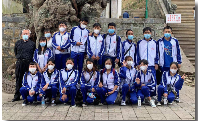
Discipling and training the next generation during difficult times is not easy. One must cling to God's promises, faithfulness and exercise great discipline and commitment.

This student's sentiments is common these days, especially from the city. Thankfully, there are Bible Training Schools like the one we equip and support in this beautiful area of Yunnan province where they can study and pray in God's creation.