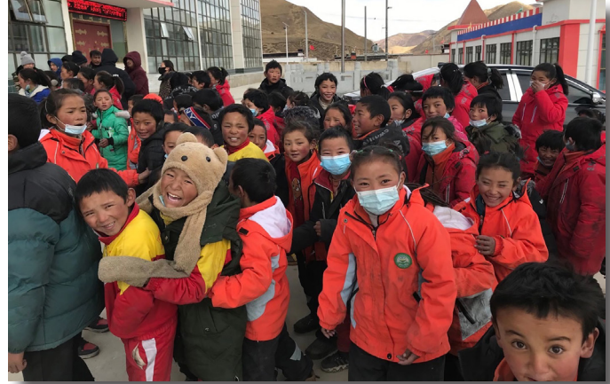
All the youth from the Sunshine Children Care Center are excited for the class and activities to start!