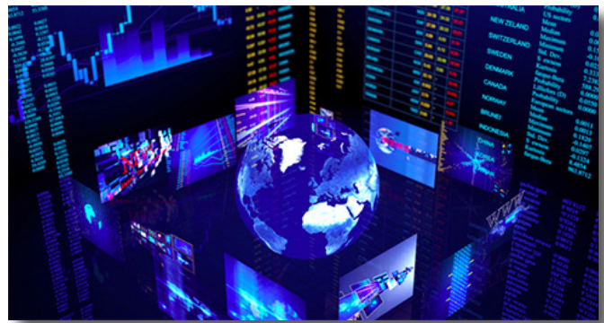
China has acquired from the U.S. and developed on its own, amazing data gathering mechanisms that continue to grow and expand not only within its country but around the world.

In recent years, most of the large scale House churches and mega churches in China’s urban centers have already been forced to close. House churches in every large city have now dispersed into congregations less than 50 or they meet in cell-groups. Since Xi Jinping’s rise to power, his directives have been to transform every sector of life to socialistic ideology. Science is “god.” Even religious festivals in schools and in public have diminished.