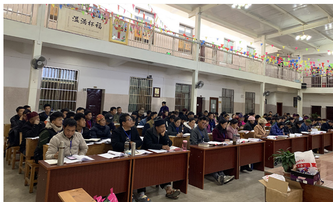
East Gates' work with training centers like this one in Yunnan Province is invaluable because once these pastors and lay trainers finish, they will go back to their congregations and teach others. We emphasize “practical theology.”

Chinese Christians and their communities of faith, led by the Holy Spirit and Word of God, know they do not need a Social Credit System in which to be monitored, judged, rewarded or punished. They know Titus 2:11-15 by heart. “For the grace of God has appeared, bringing salvation to all men, instructing us to deny ungodliness and worldly desires and to live sensibly, righteously and godly in the present age, looking for the blessed hope and the appearing of the glory of our great God and Savior, Christ Jesus, who gave Himself for us to redeem us from every lawless deed, and to purify for Himself a people for His own possession, zealous for good deeds. These things speak and exhort and reprove with all authority. Let no one disregard you.”