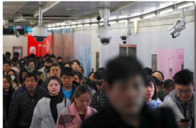
In 2020, China will have 626 million surveillance cameras positioned throughout the country.