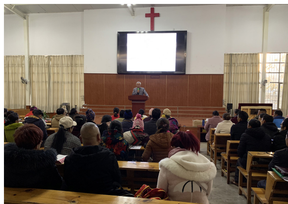
Given the challenging times, there is greater need for more trained pastors to minister to the substantial increase in smaller groups. They need our genuine encouragement and prayers.