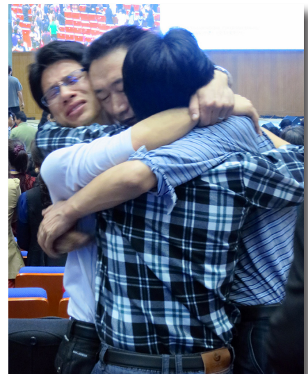
House church brothers embrace during a private gathering.