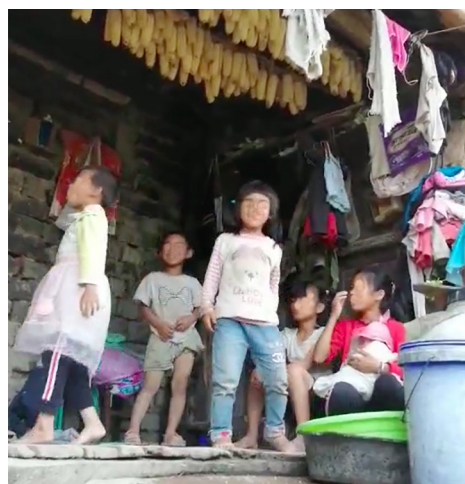
As in the time of the 1st century church, when the parents become “souled out” on God’s Truth, the children soon follow from their example.