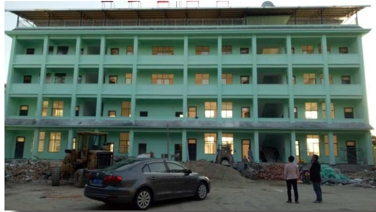
Despite the economically depressed area in which these believers live, God has given them a big vision. They know that if they seek the Kingdom of God first and His righteousness, everything else will come (Matthew 6:33). Slowly, it has. They've built the Teachers' Housing Units and now they're finishing the Training Center. Funds have been limited but classes still continue. The Chinese don't need perfect conditions in which to study and learn.