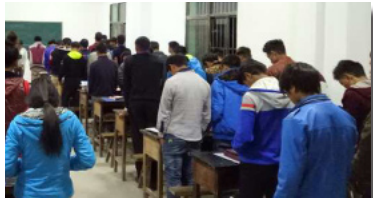
Students at an early morning prayer meeting. At present, they have 11 teachers and 90 students.