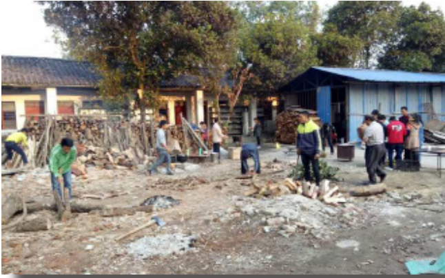
Staff and students work together to chop the necessary wood to cook their food. The blue building in the background is the kitchen.