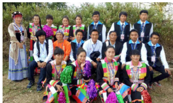
A few of the many talented Lisu tribe believers.