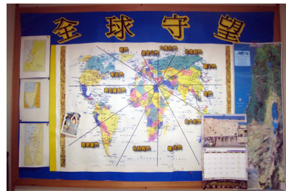
We hope and pray that in time this training center can be another spiritual outpost that understands the biblical importance of Israel in the context of the nations. We will see prayer boards go up like this one which says, "The Whole World Keep Watch."