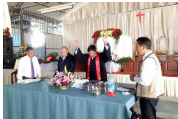
As the number of Yingjiang believers grow, their training center will become more important to the spiritual vitality of the church and community. They will need additional pastoral leaders, lay trainers and co-workers to mentor and shepherd the flock. They will need gifted counselors who can answer questions for their youth who are seeking true life in a rapidly changing and hopeless world.

PLEASE KEEP THE YINGJIANG COUNTY CHURCHES IN YOUR PRAYERS.