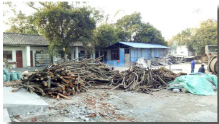
In China's countryside, the word for "church" is not a noun but a verb. It functions like a small community where everyone has a purpose and a calling.