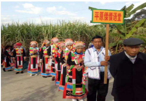
A procession of Lisu tribe believers come to the Christmas gathering. The sign says, they are the church that speaks the Lisu dialect. East Gates provides Bibles to Lisu believers in their language (right).

PLEASE KEEP THE YINGJIANG COUNTY CHURCHES IN YOUR PRAYERS.