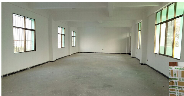
This room will be their future library. When resources become available, bookshelves will follow. In anticipation of what is to come, East Gates has already sent Bibles and Christian materials (right). The faculty and students don't feel they're a genuine training center until the library is complete.