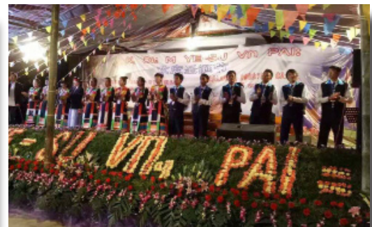
Every year, churches in Yingjiang County have a major Christmas celebration. Thousands participate in the festivities.