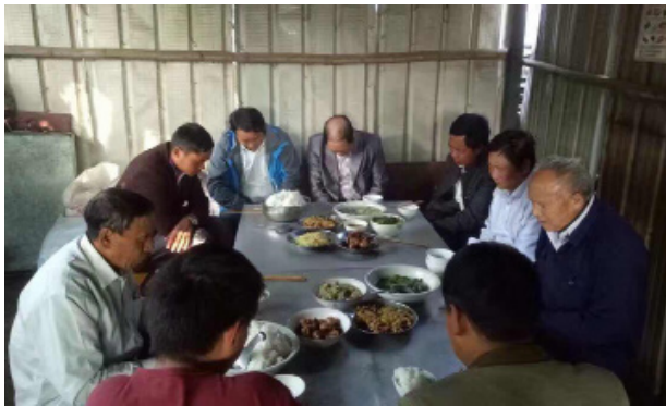
Pastoral leaders in the Yingjiang County area gather for a meal and church meeting.