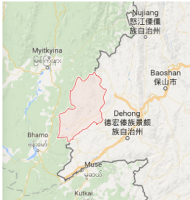
Yingjiang County (red outlined area) is located on the western border of Myanmar or Burma. It's a very mountainous and seismically active area.