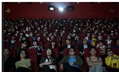
Chinese watching a Western movie in 3D.

Today, the U.S. is inextricably intertwined with China. For the present Chinese generation, it seems whatever comes from West is the best. Fashion, food, movies, technology, social values and lifestyle choices. Wherever you turn, it's present in China.