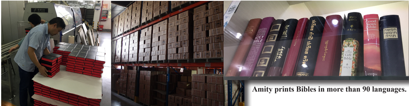
Amity prints Bibles in more than 90 languages.

Despite the many “signs of the times” we saw hitting China, we were also greatly encouraged to see how many of the seeds we helped plant decades ago had now taken fruition. Our regular stop to Amity Printing Press enabled us to see how they had just finished printing 150 million Bibles, mostly for export. If each Bible were about 2 inches thick, 150 million Bibles stacked would be 848 times the height of Mt. Everest!