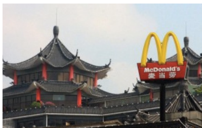
Chinese live on "fast food." Fast everything.