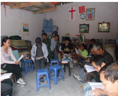
East Gates, like AF, continues to provide Christian love and resources to help the disenfranchised, be it providing Bible studies to the homeless (left) or giant-size print Bibles for the elderly in remote areas (right).