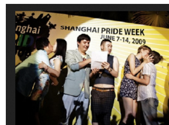
Gay Pride Week celebration in Shanghai.

About 30 years ago, when East Gates first entered China, a high-level ranking Chinese leader said, "If you want to come share the Gospel of Jesus Christ in China, you must come quickly because in 40-years they will have unteachable hearts." What he said has pretty much come true. In a sense, the same can be said for America as well. It's not so much that people aren't interested in God or Jesus but in this cyberspace age, it's too easy to create Him in our own image versus allowing God to create us in His own image. There is a major difference. To allow God to change us into His image these days is not comfortable, nor is it convenient. God doesn't answer questions or prayers as fast as an app or WeChat.