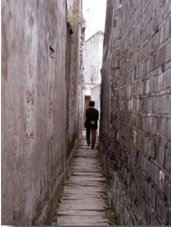
NOT THE PLACE TO BE...