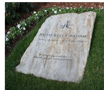
Ruth Bell Graham's gravestone. (1920-2007). At the top is the Chinese character for righteousness.