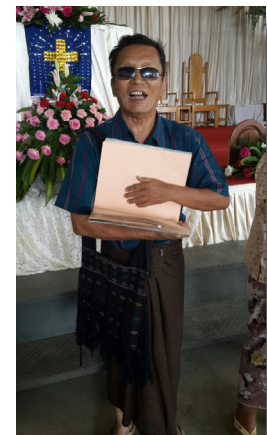
East Gates blesses the blind with braille Bibles so they can really "see!"