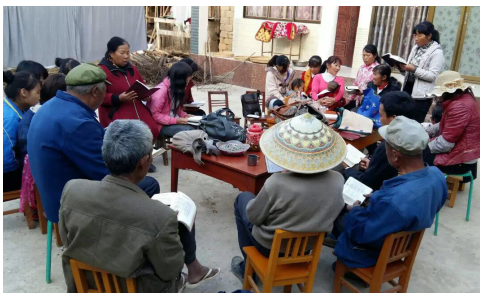
Baoshan Village, Yunnan Province. East Gates partners with local churches to hold Bible studies to teach villagers about eternal freedom through God's Truth.