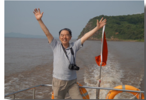
THE PLACE TO BE -- FREEDOM!!

Once Chinese wholeheartedly receive what their Creator wants to pour through them, Psalm 118:15 becomes a reality.