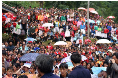
East Gates brings God's revelatory Word to thousands in Yunnan Province where China's minority groups thrive.