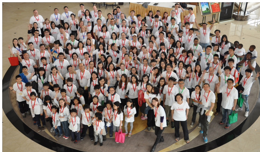
2014 Thanksgiving Church Retreat, Shanghai