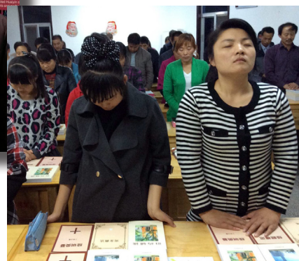
A humble and teachable spirit is precious in God's sight.

T hrough your loving support, thousands of Chinese are joining God's family each day. In God's Book of Life, He knows each one by face and name. May our Lord increase East Gates' capacity to fulfill the Church in China's growing needs this coming year.